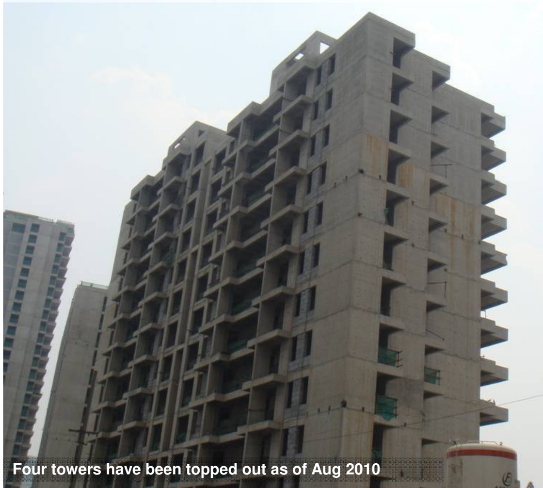
Four towers have been topped out as of Aug 2010