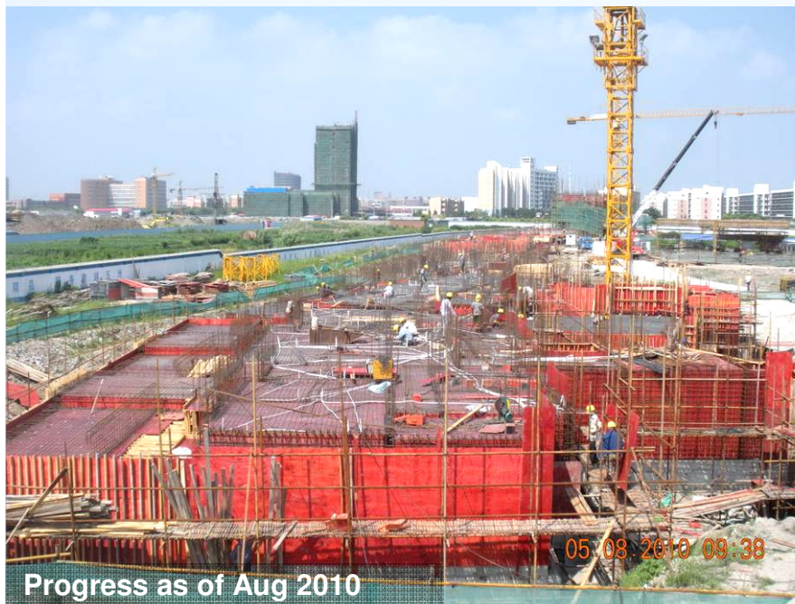
Progress as of Aug 2010