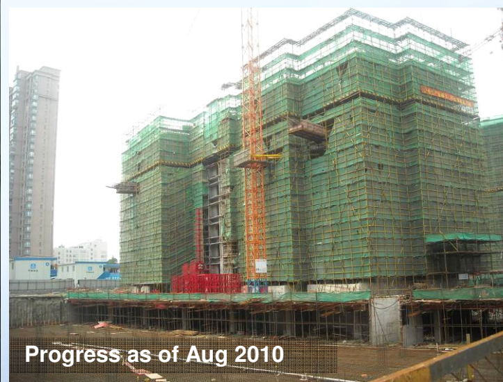
Progress as of Aug 2010